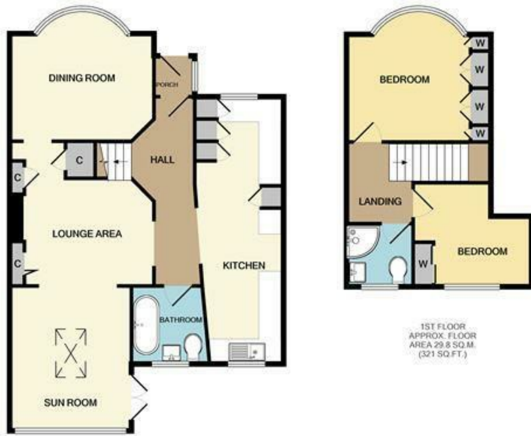
GROUND FLOOR APPROX. FLOOR AREA 67.8 SQ.M. (729 SQ.FT.)